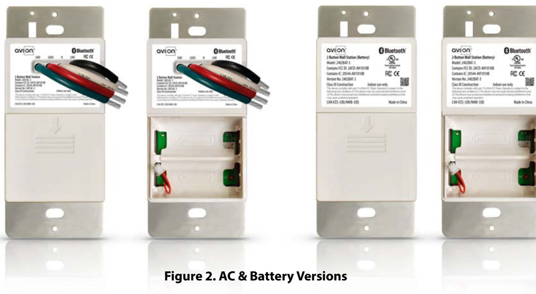
Figure 2. AC & Battery Versions

ALL PRODUCT, PRODUCT SPECIFICATIONS AND DATA ARE SUBJECT TO CHANGE WITHOUT NOTICE TO IMPROVE RELIABILITY, FUNCTION OR DESIGN OR OTHERWISE. The information contained herein is believed to be reliable. Avi-on makes no warranty, representation or guarantee regarding the information contained herein, the suitability of the products for any particular purpose, or the continuing production of any product. Avi-on assumes no responsibility or liability whatsoever for the use of the information contained herein. The information contained herein, or any use of such information does not grant, explicitly or implicitly, to any party any patent rights, licenses, or any other intellectual property rights, whether with regard to such information itself or anything described by such information.