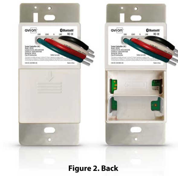
Figure 2. Back

ALL PRODUCT, PRODUCT SPECIFICATIONS AND DATA ARE SUBJECT TO CHANGE WITHOUT NOTICE TO IMPROVE RELIABILITY, FUNCTION OR DESIGN OR OTHERWISE. The information contained herein is believed to be reliable. Avi-on makes no warranty, representation or guarantee regarding the information contained herein, the suitability of the products for any particular purpose, or the continuing production of any product. Avi-on assumes no responsibility or liability whatsoever for the use of the information contained herein. The information contained herein, or any use of such information does not grant, explicitly or implicitly, to any party any patent rights, licenses, or any other intellectual property rights, whether with regard to such information itself or anything described by such information.