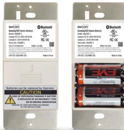
Figure 2. Back

ALL PRODUCT, PRODUCT SPECIFICATIONS AND DATA ARE SUBJECT TO CHANGE WITHOUT NOTICE TO IMPROVE RELIABILITY, FUNCTION OR DESIGN OR OTHERWISE. The information contained herein is believed to be reliable. Avi-on makes no warranty, representation or guarantee regarding the information contained herein, the suitability of the products for any particular purpose, or the continuing production of any product. Avi-on assumes no responsibility or liability whatsoever for the use of the information contained herein. The information contained herein, or any use of such information does not grant, explicitly or implicitly, to any party any patent rights, licenses, or any other intellectual property rights, whether with regard to such information itself or anything described by such information.