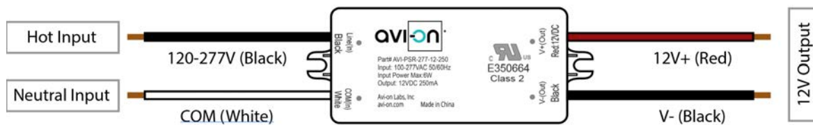
Figure 2. Wiring Diagram

ALL PRODUCT, PRODUCT SPECIFICATIONS AND DATA ARE SUBJECT TO CHANGE WITHOUT NOTICE TO IMPROVE RELIABILITY, FUNCTION OR DESIGN OR OTHERWISE. The information contained herein is believed to be reliable. Avi-on makes no warranty, representation or guarantee regarding the information contained herein, the suitability of the products for any particular purpose, or the continuing production of any product. Avi-on assumes no responsibility or liability whatsoever for the use of the information contained herein. The information contained herein, or any use of such information does not grant, explicitly or implicitly, to any party any patent rights, licenses, or any other intellectual property rights, whether with regard to such information itself or anything described by such information.