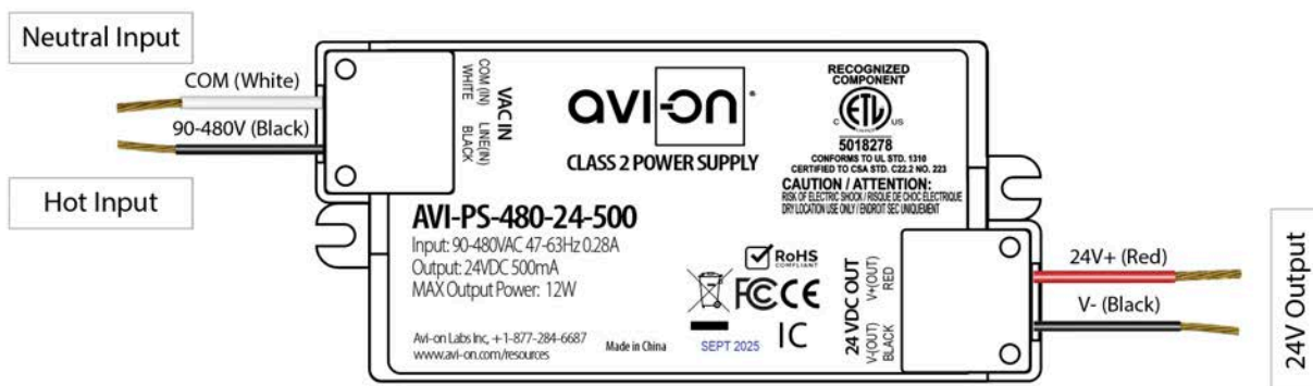
Figure 2. Wiring Diagram

ALL PRODUCT, PRODUCT SPECIFICATIONS AND DATA ARE SUBJECT TO CHANGE WITHOUT NOTICE TO IMPROVE RELIABILITY, FUNCTION OR DESIGN OR OTHERWISE. The information contained herein is believed to be reliable. Avi-on makes no warranty, representation or guarantee regarding the information contained herein, the suitability of the products for any particular purpose, or the continuing production of any product. Avi-on assumes no responsibility or liability whatsoever for the use of the information contained herein. The information contained herein, or any use of such information does not grant, explicitly or implicitly, to any party any patent rights, licenses, or any other intellectual property rights, whether with regard to such information itself or anything described by such information.