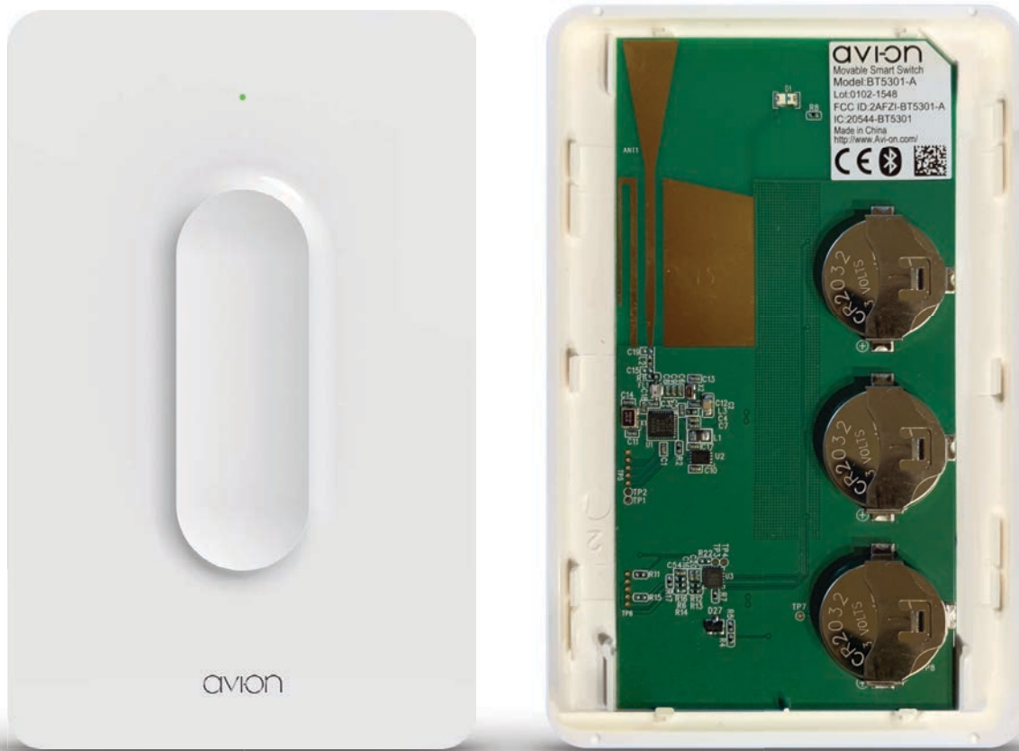
Figure 2. Avi-on Movable Switch ( Front & Battery View)

ALL PRODUCT, PRODUCT SPECIFICATIONS AND DATA ARE SUBJECT TO CHANGE WITHOUT NOTICE TO IMPROVE RELIABILITY, FUNCTION OR DESIGN OR OTHERWISE. The information contained herein is believed to be reliable. Avi-on makes no warranty, representation or guarantee regarding the information contained herein, the suitability of the products for any particular purpose, or the continuing production of any product. Avi-on assumes no responsibility or liability whatsoever for the use of the information contained herein. The information contained herein, or any use of such information does not grant, explicitly or implicitly, to any party any patent rights, licenses, or any other intellectual property rights, whether with regard to such information itself or anything described by such information.