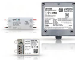
PHASE DIMMER KIT