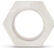
ADDITIONAL PIR NUT