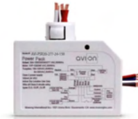
24V POWER SUPPLY (20A RELAY)