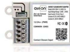
SENSOR INPUT MODULE (SIM)