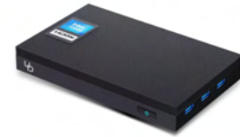
OPENADR DEMAND RESPONSE