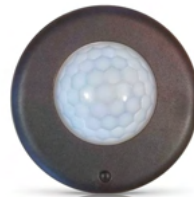
DIRECT CONNECT OUTDOOR PIR