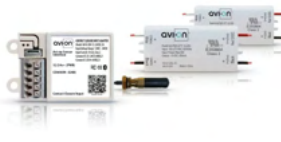
UL 924 NORMAL POWER BEACON (SIM)