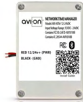
NETWORK TIME MANAGER