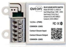
RELAY CLOSURE OUTPUT