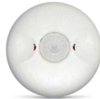
NON-BLE PIR SENSOR