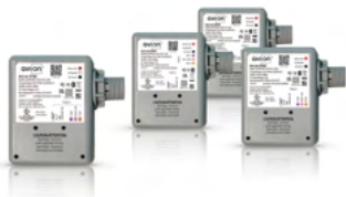
UL 924 ZONE CONTROLLER (XFAC)