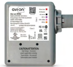
DIRECT CONNECT XFAC