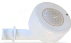
DIRECT CONNECT PIR