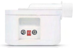
MICROWAVE (IP65 ENCLOSURE)