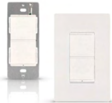
2 BUTTON WALL STATION