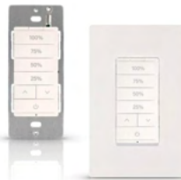
DIMMING WALL STATION