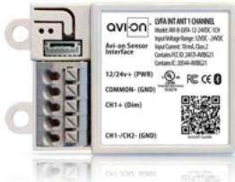
DIRECT CONNECT LVFA