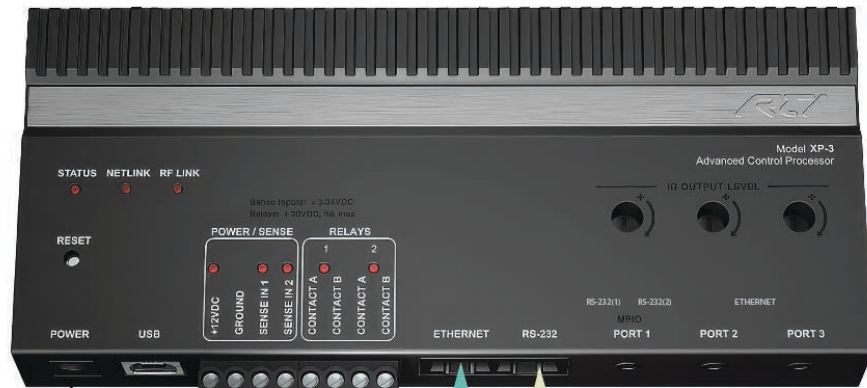
XP-3 Control Processor